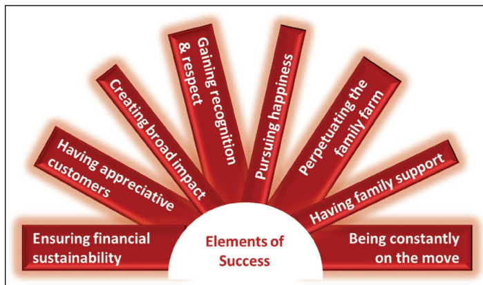
Figure 2. Women's understanding of success.

Participating women viewed success as being composed of eight aspects: ensuring financial sustainability, having appreciative customers, creating broad impact, gaining recognition and respect, pursuing happiness, perpetuating the family farm, having family support, and being constantly on the move (Figure 2). These aspects were present across women's life-cycle stages. However, farmers in their twenties and thirties did not discuss perpetuating the family farm as an aspect of success. This may be due to the fact they are in the early stages of their family and entrepreneurial paths.