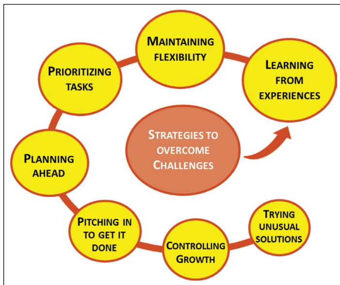
Figure 3. Strategies to overcome challenges.

Maintaining flexibility and controlling growth were not strategies women in their twenties and thirties used, most likely because they have less experience in business planning than older participants.